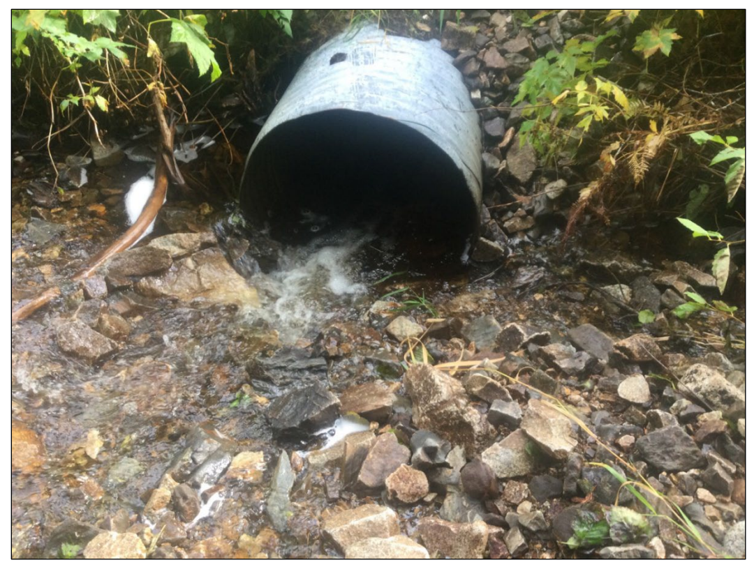
Figure 2.–Culvert inlet at waypoint 2508.