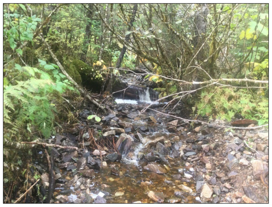
Figure 1.-Channel upstream of culvert at waypoint 2508.