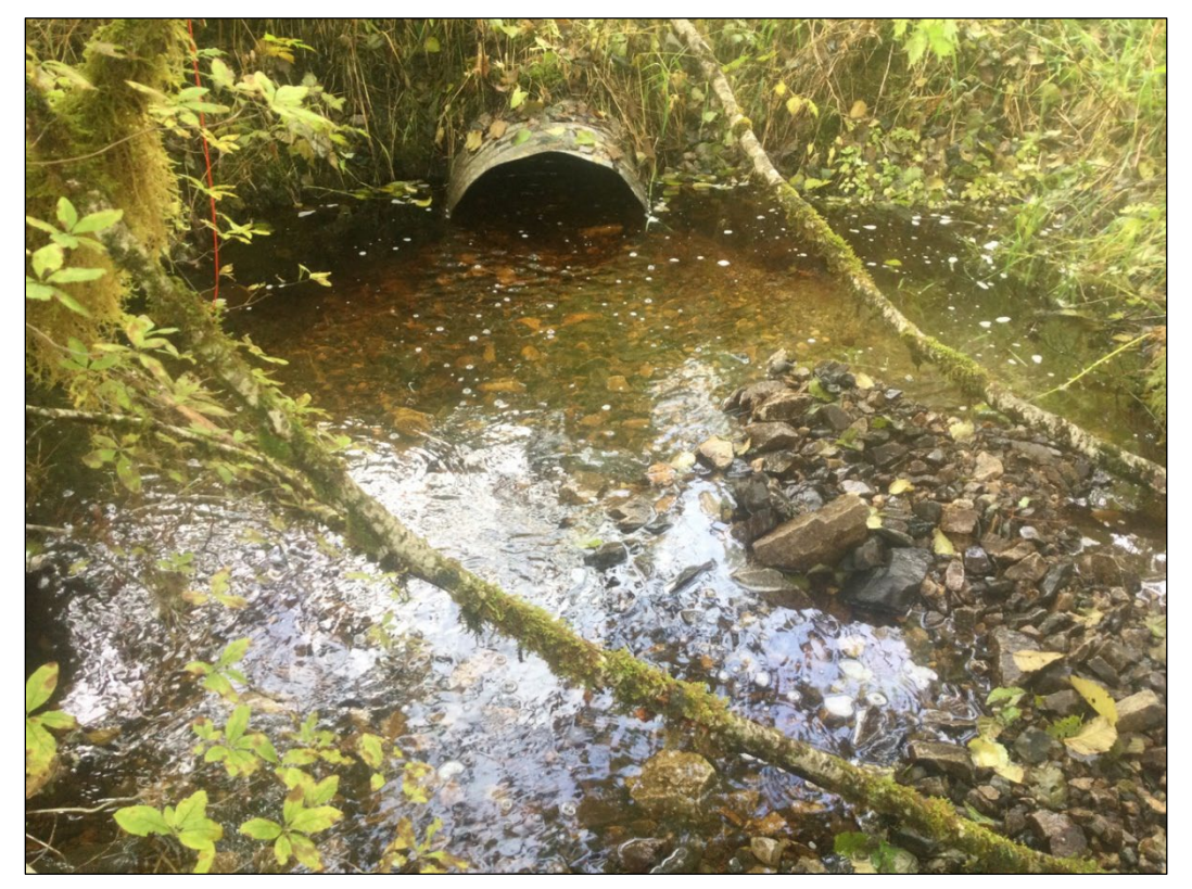
Figure 3.–Culvert outlet at waypoint 2508.